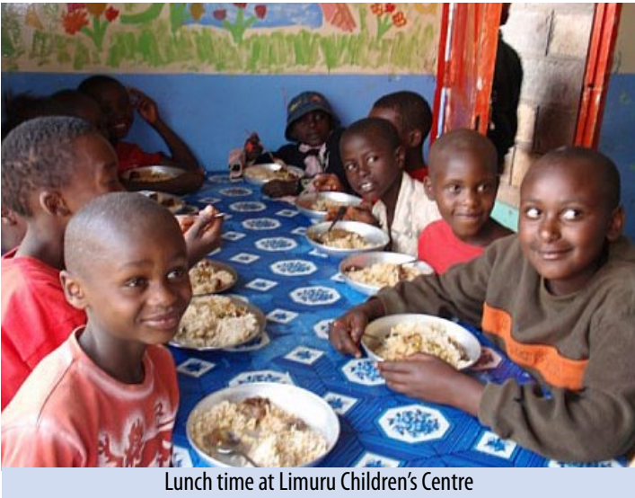
Lunch time at Limuru Children's Centre