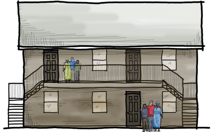
FRONT ELEVATION- BABY CENTRE AND NEW LCC HOME