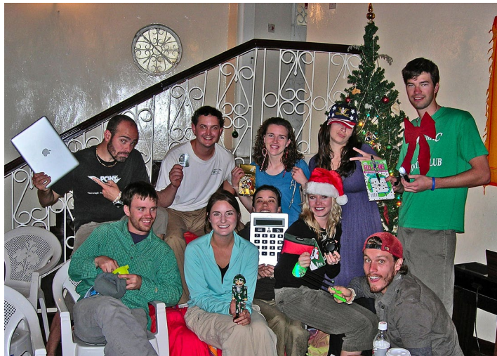
Celebrating Christmas at the Mzungu Manor

As with many people that come on this experience, some in the groups did not know the reason why they had traveled so far but discovered it during their stay here and even after they returned home. It was great to see tripgoers jump in with our partner programs after being here for 2 or 3 days and asking the questions, getting their hands dirty, and wearing themselves out swinging kids around in the air without any needed leadership from the staff. Both teams visited a "sampler" of our partner programs - Limuru Children's Centre, LCC K-Branch, Pat's Feeding Program, Care for AIDS, Care of Creation, and St. Jerome's Church in Kibera. When a free afternoon opened up, many people took the opportunity to get more in-depth with the program